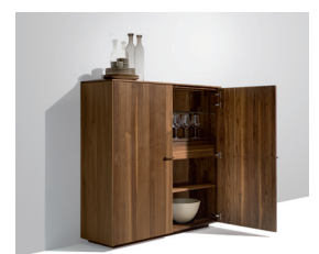
filigno sideboard and highboard link cooking, dining and living areas