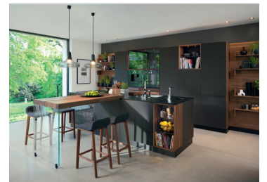
black line kitchen

black line is a strikingly elegant version of the linee kitchen, created by TEAM 7's head designer, Sebastian Desch. Matt black coloured glass is combined with fine smoked glass, matt black handles and plinth panels. Open and closed design elements made from pure solid wood give the kitchen a more relaxed style and create a cosy look. Of course, black line remains a solid wood kitchen at heart: behind the cool elegance of its black surfaces are solid wood elements, giving the kitchen warmth and stability. This purist designer version of a solid wood kitchen combines wood, glass and metal to create a thoroughly modern kind of cosiness.