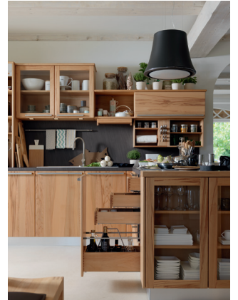
country cottage warmth

In the rondo country-style kitchen, the interiors of cupboards and drawers can be designed to your own requirements and ideas – with options such as the ingenious plate shelf that protects porcelain dishes. The flexible spacers can be adjusted to the size of your plates and dishes using the matrix of holes in the solid wood base. Natural wood also has the great advantage that it is particularly protective of good porcelain.