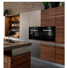
exciting combinations of materials