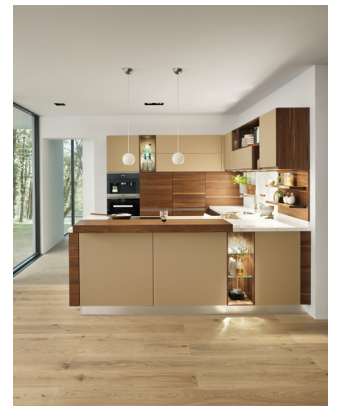
versatile design style

Open, solid wood alcoves can be integrated into the linee kitchen to provide display space for decorative accessories. These are ideal for attractive jars, spice mills or a pestle and mortar. Alcoves loosen up the overall look and can be used as display cases – especially when designed with doors in clear or smoky glass. They can also be fitted with dimmable LED lighting as desired. The rear walls of these display cases can also be individually designed, with glass in various colours or solid wood with horizontal or vertical grain pattern.