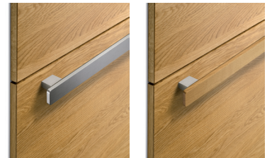
new bar handle in stainless steel finish or wood

The latest kitchen creation from TEAM 7 is the cera line , which offers the perfect combination of wood with another high quality natural material: ceramic. Generous use of this material is the defining feature here, creating an exciting contrast with the natural solid wood surfaces. Ceramic also offers many practical advantages in everyday use. It is hygienic and easy to care for, making it ideally suited for contact with foodstuffs. Knife blades, liquids and even acidic substances will not damage this resilient material. This tasteful combination of wood and ceramic creates a distinctive style with a delightfully warm and cosy character.