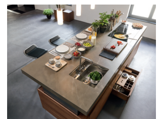
all-in-one – work surface and breakfast bar