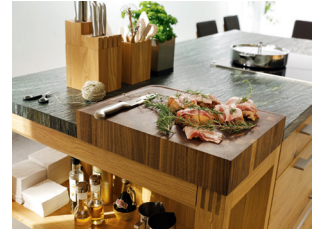
integrated butcher's block with juice rim

The loft kitchen combines the natural qualities of wood – including its many positive characteristics – with the elegance of craftsmanship detailing and finish, as well as optimal functionality.