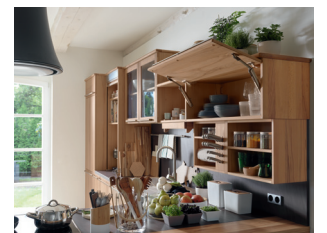
practical and compact

This press release, in addition to other press materials and photos, is available for download at www.team7.at .