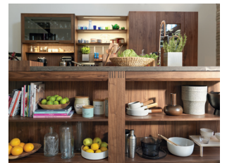
authentic materials and premium artisan craftsmanship

This press release, in addition to other press materials and photos, is available for download at www.team7.at .