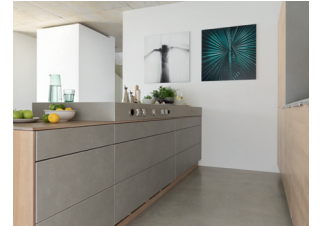
kitchen island with ceramic work surface

Customers designing their filigno dream kitchen have a choice of several different wood types, as well as fronts in coloured glass or ceramic, and various styles of handles. Interiors for kitchen storage furniture are also individually designed for each customer. The result is high-quality unique kitchens.