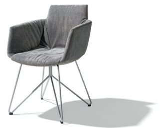
the new dining chair: grand lui with slender wire frame