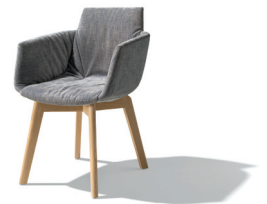
grand lui with classic wooden frame

In addition to various base formats, a range of wood types, metallic surfaces as well as fabrics and leather are available. New: the Maple fabrics from Kvadrat. These covers let you combine not only two colours but also mix materials: the shell of a grand lui or lui can be covered with leather on the outside and fabric on the inside – or the other way around. On the whole, all these options create a virtually infinite range of design configurations.