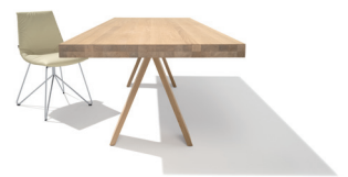
tema in oak white oil with A-frame

This press release, in addition to other press materials and photos, is available for download at www.team7.at .