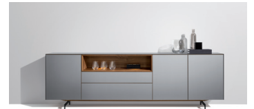
cubus pure sideboard

The basic concept for the sol standalone desk consists of two interlocking trays: the pull-out writing surface is covered with traditionally finished or natural leather, and the second tray displays the beautiful natural features and high quality craftsmanship of its solid wood. When it is extended, sol offers a generous area for anyone sitting in front of it and easy access to the interior features: A socket with USB connector, wireless Qi charging station, containers for writing equipment, pen trays carefully sculpted from the solid wood, a secret compartment, and optional LED lighting – these are what make sol a smart, high-quality place to work. It is available in a freestanding version or wall-supported version with two legs, and fits elegantly into any living area. Its clear, standalone design attracts attention wherever it is.