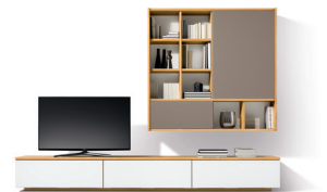
cubus wall unit

The cubus shelf system has shelves made of wood or glass, fronts with hinged or sliding doors, drawers and flaps, LED lighting accents, and open shelves to allow for an almost unlimited freedom in design and arrangement. There are not only numerous ways to