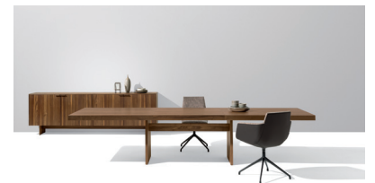
tema table in walnut, filigno sideboard and lui/grand lui chairs

Two different styles of base are available for the tema dining table, which both harmonise equally well with the table top. Solid wood panel ends provide stable support and also emphasise the linear, timeless character of the design. The stretcher not only highlights the craftsmanship of the design, it also ensures maximum stability. The A-frame base gives the impression that the tema table top is balanced on the point of the "A". This table is a work of art with "wow factor" – especially when viewed from the front end. A-legs give tema a modern and expressive appearance. The clear design and generous leg-room are impressive in both versions.