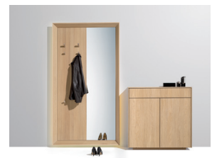
haiku combi wall panel with lighting, and filigno dresser

The hood clothes rack can be used as a versatile extension or alternative to wall panelling, a concealed coat cupboard or closed wardrobe. Its four-limbed construction consists of a central X element with two side supports attached, forming a gently curved nodal point. And if more space is needed, it also has a big brother, hood+ , with two of the basic elements joined by a wooden rail.