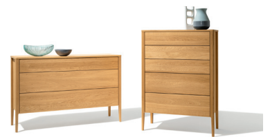
mylon dressers in oak

Small but mighty: books, reading glasses, scented candle and water glass have space on and inside the new mylon bedside cabinet. The stylish solid wood cabinet is offered in different versions – open or with a drawer, at a normal or a comfort height. When the compact, practical piece is placed directly next to the mylon bed, everything needed for