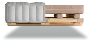
aos integrated system

This press release, in addition to other press materials and photos, is available for download at www.team7.at .