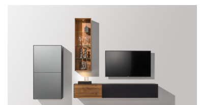
cubus pure wall unit

This press release, in addition to other press materials and photos, is available for download at www.team7.at .