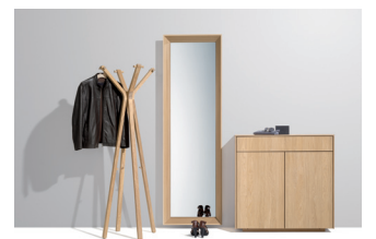
hood clothes rack, haiku mirror and filigno dresser

This press release, in addition to other press materials and photos, is available for download at www.team7.at .