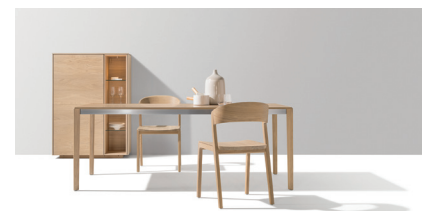
tak table, mylon chair and filigno highboard

This press release, in addition to other press materials and photos, is available for download at www.team7.at .