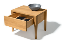
a place for everything

This press release, in addition to other press materials and photos, is available for download at www.team7.at .