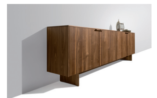
filigno sideboard with wooden handles and wood panel base

This press release, in addition to other press materials and photos, is available for download at www.team7.at .