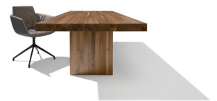
tema table with wood panel base

While the size of other extendable dining tables can only be increased on one side, the integrated inserts of the tema table are positioned in the centre and the table top grows at both ends. The table frame stays in its position – perfect for placement on a carpet or in combination with a bench that is centred at the table even after the extension.