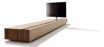
cubus Home Entertainment