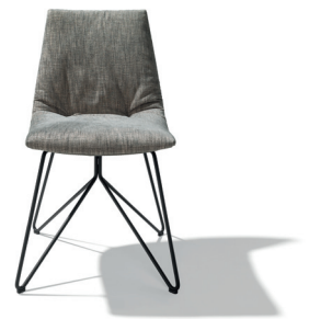
lui chair with Maple fabric and matt black frame

This year TEAM 7 is expanding its portfolio of upholstery fabrics: with the new Maple range of fabrics from Kvadrat, TEAM 7 customers now have even more high-quality textiles to choose from when designing their favourite furniture. Inspired by the beauty of the forests and Japanese maple, this fabric collection is an excellent match for the solid wood specialist TEAM 7. The Maple fabrics are woven with a high proportion of viscose, a glossy cellulose fibre made from wood. Viscose gives these fabrics a special sheen, which changes depending on the light and the perspective of the observer. The Maple collection fabrics are woven with a chenille yarn, which has a soft pile, velvety appearance and distinctively appealing texture. The fabrics are available in 13 colours – a harmonious range of natural nuances. They can be selected as upholstery fabric for many of TEAM 7's chairs and benches. The new collection is also a great choice for the bedroom: the float bed, mylon bed and mylon bench can be covered with Maple fabric.