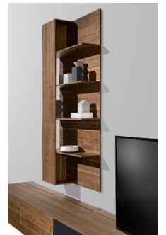
wall panel with a screened section

In the filigno range, the focus is on the pure solid wood. To make it possible to create entire filigno configurations purely using this material, TEAM 7 has developed a new wooden handle that is made to match their furniture, using the same wood type. The handle is delicate-looking but functionally robust, and its 12 mm profile is a perfect match with the equally slender solid wood casing of the furniture. A particularly pleasing detail is the slight recess that has been sculpted into the underside of the new wooden handle, allowing a more secure finger-grip on the handle.