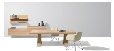
tema table in oak white oil, filigno sideboard and lui/grand lui chairs