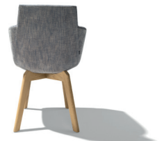
it even looks good from behind