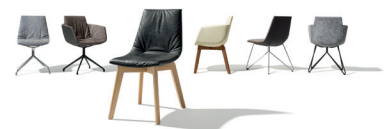
lui/grand lui family

The seating furniture in the lui family is based on a solid, ergonomic moulded wood shell. Together with a custom-made polyurethane foam coating, covered in elegant leather or fabric, this lets the chair nestle perfectly around the body. The characteristic folds of the grand lui and lui chairs suggest the flowing fabric of a haute-couture gown. But when you look the lui family in the face, you might also think of laugh lines or a wink. These gentle folds look casual, but are the result of considerable technical skill, combined with detailed hand finishing. The trick is in the hand-crafted indentations, a technique borrowed from traditional upholstery work. In the grand lui , the folds that begin in the seat shell are carried right through the armrests. The grand lui upholstered chair is truly a feel-good chair. Not just because it seems to smile or wink at you. The crumpled look and ergonomically perfected height of the armrests contribute to an optimal seating experience.