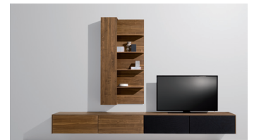
filigno wall unit in walnut

The open-plan layouts of modern homes are increasingly blurring what were once clear lines dividing cooking, dining and living areas. The filigno range from TEAM 7 makes it possible to create elegant, flowing transitions between kitchen, dining and living areas. The delicate style of filigno solid wood furniture is defined by three-layer boards, just 12 mm thick, which encase the elements, combined with a fine shadow gap at the edge. Thanks to TEAM 7's advanced three-layer technology, the solid wood panels are – in spite of how thin they are – incredibly strong. Edge inserts underline TEAM 7's superior craftsmanship and expert use of solid wood.