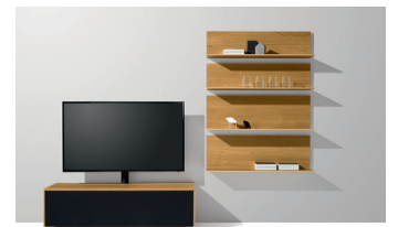
filigno Home Entertainment in oak