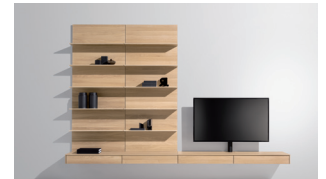
filigno wall unit with extremely slim console

TEAM 7 is also introducing a new kind of wall panel for filigno . Here, the open shelves are covered on one side by a solid wood panel. This creates a wall panel that is partly open, partly closed, making it possible to display decorative items – while also hiding other things from view behind a concealing panel.