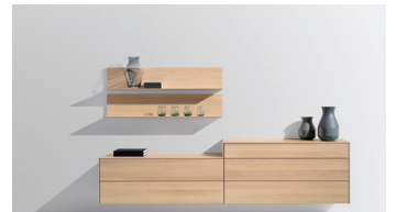
filigno sideboard in oak white oil

This press release, in addition to other press materials and photos, is available for download at www.team7.at .