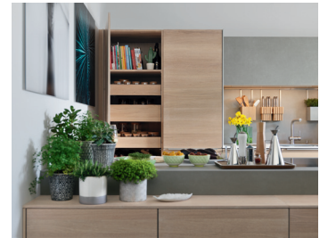
a natural treat for the senses

Kitchens today are no longer hidden behind closed doors, but open, welcoming and, above all, flexible. The floor plans of modern apartments give these layouts ample space. In keeping with this trend, TEAM 7 has designed the combined filigno kitchen and occasional furniture line in collaboration with the design firm Tesseraux + Partner. More furnishings rather than kitchen, natural materials such as wood and ceramic arouse one's appetite for this new form of cosy living. It can be used as a sideboard, work surface or functional kitchen island – in all cases, the clear design language of the system guarantees a consistent flow from the kitchen into the living area. And it is thoroughly sophisticated: the front part of the island serves as a sideboard, while the attached work surface made of ceramic turns it into a functional cooking island. Light, delicate and with an elegant emphasis on wood. The filigno occasional furniture pieces are also perfect companions for the fusion of the kitchen, living, and dining areas. They offer creative freedom for open designs. Pure and high-quality: the precise finishing details and smart functionality of the distinguished side- and highboards enhance any room.