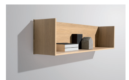
wall shelf, U form

This press release, in addition to other press materials and photos, is available for download at www.team7.at .