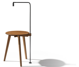
hi! side table with LED lamp

The round hi! side table weighs only 2.3 kilos and cuts a fine figure wherever it is needed – in the living room, entry hall, or bedroom. Three solid wood legs joined with cross-lap and mortice-and-tenon joints ensure great stability and robustness. One of the legs is extended upwards beyond the table. This design feature is what makes hi! really multi-talented: Here you can have a leather loop as a handle for easy manoeuvring, a hook support for the beautifully crafted TEAM 7 shoehorn, made in matching wood, or as a real hi! -light, an LED lamp which can be swivelled around, turned sideways or slanted downwards. This table is certainly versatile. As an alternative to the solid wood version – surrounded by a leather strip which serves both as a design feature and as protection for the edge – the table top is also available in clear glass. This enhances the lightness of the table's design, and allows the solid wood craftsmanship of the base to be clearly seen.