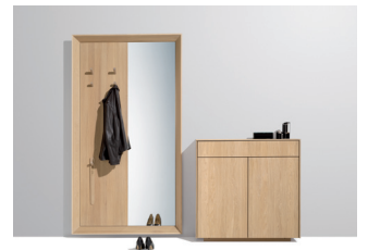
filigno dresser with haiku combi wall panel

This press release, in addition to other press materials and photos, is available for download at www.team7.at .