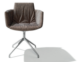
grand lui with Maple fabric and swivel base

This press release, in addition to other press materials and photos, is available for download at www.team7.at .