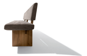
wood panels to match the tema table

This press release, in addition to other press materials and photos, is available for download at www.team7.at .