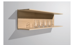
wall shelf, C form