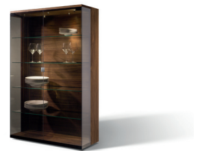
nox glass cabinet

A characteristic feature of the filigno occasional furniture, designed by Sebastian Desch, is the delicate casing of genuine solid wood that is lightened at the corners by delicate shadow gaps. The top board and sides of the filigno occasional furniture are made of solid wood panels that are only 12 mm thick, manufactured with the latest three-layer technology. This gives them an enormous stability despite being so thin. These pieces of occasional furniture fit perfectly with the filigno kitchen as they share the same characteristics. The island, featuring an attached ceramic work surface, creates a flowing transition from the kitchen to the dining area thanks to the sideboards and highboards, which merge harmoniously into a cosy ensemble. The occasional furniture items feature drawers, hinged and sliding doors with functional interiors, LED lighting, and integrated electrical sockets. Open or closed design elements resemble display cases. Fronts are available, of course, in solid wood, but also in coloured glass and ceramic finishes. The recessed plinth and the cubus pure slides provide a free-floating light impression and lend the filigno occasional furniture its characteristic sense of airiness.