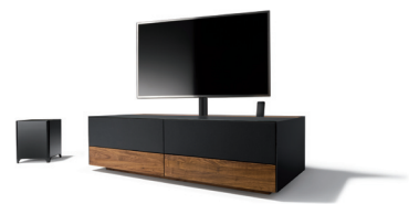
cube pure Home Entertainment with TV column in matt black

TEAM 7 introduced the metal colour matt black last year. Metal with a matt black finish is perfectly suited to an industrial chic style, and also to many other types of modern interior design. Initially the swivel base of the lui chair was introduced in the matt black colour. Due to the great popularity of the trend colour, TEAM 7 is now expanding its range of furniture with metal elements in matt black . The new wire frame for the lui and grand lui chairs is offered in matt black , as is the frame of the magnum or f1 chair and the slim legs of the tak table. In the kitchen, matt black handles are now available. The trend colour is also celebrated in the living room: with the base plate of the lift coffee table and TV column in matt black .