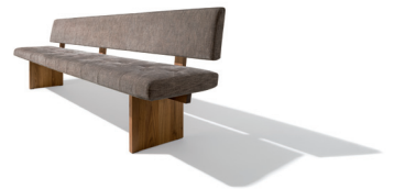
yps bench with wood panel base

Of course the tema dining table that was introduced this year can be combined with various TEAM 7 chairs, such as the lui or grand lui , which is also a fresh addition from the design studio. If you prefer a bench, you can find an ideal companion for the tema table and its A base in the yps cushioned bench with its dynamic, flared Y base. To offer a matching bench when the tema dining table is selected with wooden panel ends, TEAM 7 has refined the popular yps bench and furnished it with new wooden panels as well. The bench has the same characteristic stretcher as the table. It's not only a design element but also guarantees the highest stability, despite the delicate material thickness. Otherwise the