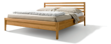
occasional furniture to match the mylon bed

The favourite place for the new mylon bench is at the foot of a mylon bed. Here it can be used for seating – for example while putting on socks and shoes – or to hold blankets and additional pillows at night. The family relationship between the mylon solid wood bench and the bed and other occasional furniture is also obvious. Its upholstered top fits in perfectly with the upholstered headboard of the mylon bed. The pleasant upholstery of the seat makes it enormously comfortable. The fabric or leather cover of the bench can be made to match the cover of the headboard. The available upholstery fabrics include the new Maple textiles from Kvadrat. The mylon bench also has impressive hidden talents: it can be opened to store bed linens inside. Thanks to the integrated cushioning mechanism, the lid can be opened and closed gently without pinching the fingers or waking the whole family with a loud clatter. Recessed sides offer an easy way to grip the bench, enabling simple and safe handling. The mylon bench is available in various lengths starting at 90 cm – appropriately for the respective width of the bed. For seat surfaces of 140 cm or higher, the fabric of the upholstered seat is stitched in the centre so that even longer benches can offer superior, lasting comfort. Although the mylon bench was conceived as a typical bedside bench, it also cuts a fine figure in the hallway with its welcoming convenience for sitting and storage.