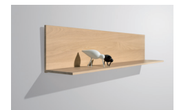
wall shelf, L form