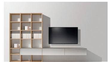
cubus pure wall unit with pearl glass