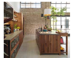
modern-day interpretation of the country cottage kitchen