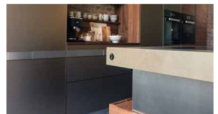
height-adjustable kitchen island

This and other press releases and photos are available to download at www.team7.at