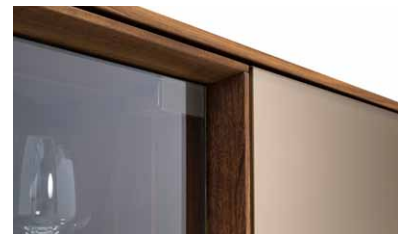
close-up of the filigno sideboard, highlighting TEAM 7's expertise with solid wood (fine construction and shadow gap)

This and other press releases and photos are available to download at www.team7.at