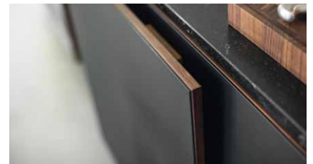
generous black coloured glass fronts are characterizing the black line