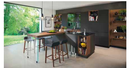
black line kitchen

GeSK agentur für public relations Ziegelstraße 29 | D-10117 Berlin Phone: +49/30/217 50 460 | Fax: +49/30/217 50 461 E-Mail: pr@gesk.info | www.gesk.info