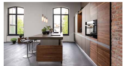
the entire kitchenblock is configured without handles