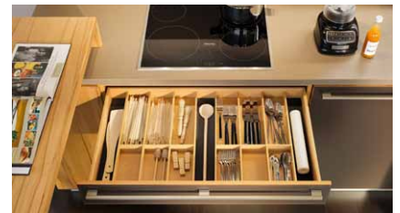
typical detail of TEAM 7: cutlery inserts made of natural wood

This and other press releases and photos are available to download at www.team7.at