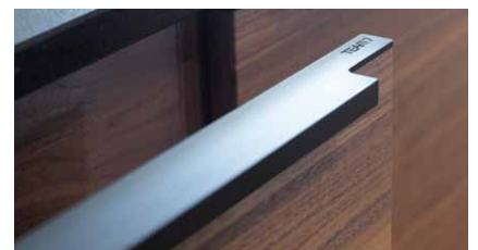
matt black handles are providing a sense of cool elegance