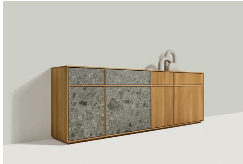
Furniture plan with filigno shelf sideboard

All TEAM 7 furniture is made of high-quality wood, both inside and out. Its hardwood comes from sustainably managed forests and is only ever finished with natural oil, enabling it to be returned to the cycle of nature at the end of its useful life. All the furniture is manufactured in the company's own plants in Upper Austria. Signs of wear on the surfaces can be erased by following some simple care measures, keeping the furniture beautiful, flexible and easy to dismantle when moving to a new home – not just now, but for generations to come. It can be extended or added to at any time.