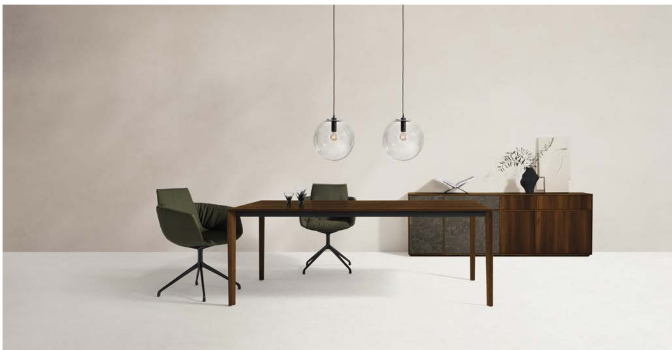
tak table and filigno shelf sideboard in smoked oak with grand lui chairs