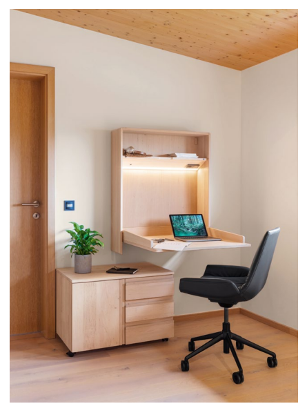
From changing station to mini-office: the wall module