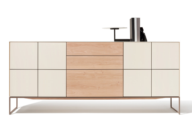
cubus pure highboard and sideboard