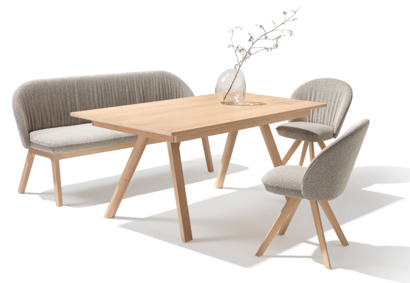
taso table with flor chairs and bench

In combination with the new white oil finish, alder wood guarantees a soft, silky feel that further enhances the feel-good factor in your own home. The light-colored pieces of furniture are perfectly accentuated by a new 24-volt lighting system that creates a lighting mood that is elegantly matched to the wood at