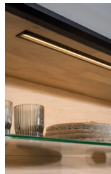
Lighting profile in matt black

At TEAM 7, innovative ideas and the development of new products and features for every corner of the kitchen are part and parcel of our sophisticated design concept. Because a kitchen is much more than a mere assortment of units, worktops and electrical appliances – it's a space that is designed with love and is brimming with emotions and personal impressions. The blend of the aura radiated by the high-quality solid wood and modern materials creates a fascinating atmosphere in the kitchen. This is also demonstrated by the new TEAM 7 kitchen arrangements, which feature elegant accents in the trend colour black, like the latest strip handles, for example: in addition to the familiar stainless steel finish, the flush-fitted strip handles are also available in a matt black version. Our solid wood kitchens exude a striking charm thanks to the combination of the dark aluminium frame doors with clear or smoked glass and our new lighting profiles, which are also available in matt black. This is how TEAM 7 kitchens create an impressive and pleasantly emotional transition to the living area and combine lifestyle factors with modern elegance.