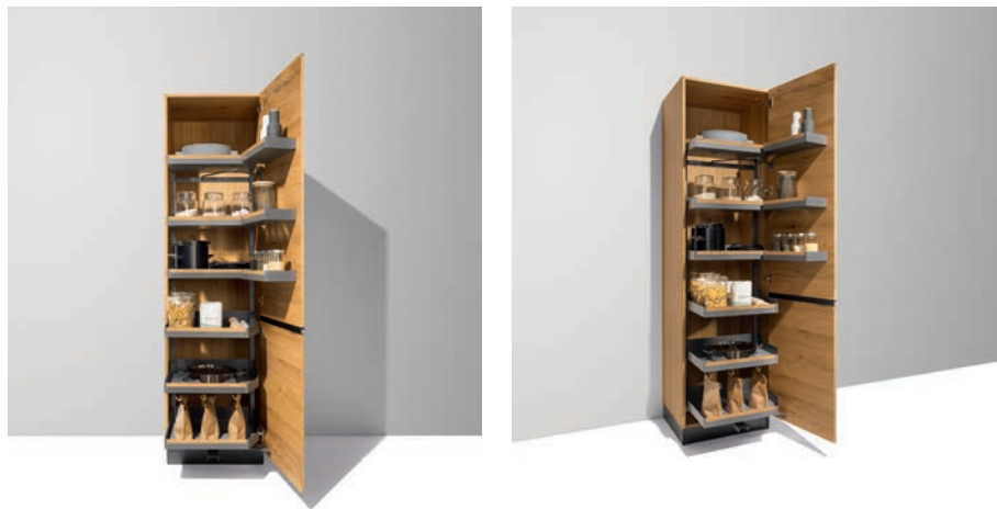
Clear storage space

A high-quality kitchen should also impress in terms of the ergonomic benefits it has to offer. To ensure that every member of the family feels comfortable in your culinary workshop, the new TEAM 7 tall cabinets meet the eye of the user when the door is opened. The shelves automatically swing out from the cupboard in a flowing movement, not only providing a perfect view of the cabinet's contents, but also making them easier to access. The new dual pull-out makes a statement with significantly larger shelves towards the bottom and easily accessible, shallower sections further up, giving you a maximum overview and more storage space. Because we like to ensure that every millimetre of space fulfils a purpose. The door shelves and pull-outs in the upper section of the cabinet provide sufficient space for cooking utensils or supplies, while large storage items can be ideally stowed in the lower section.