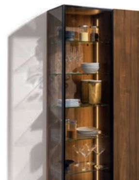
Corner display case