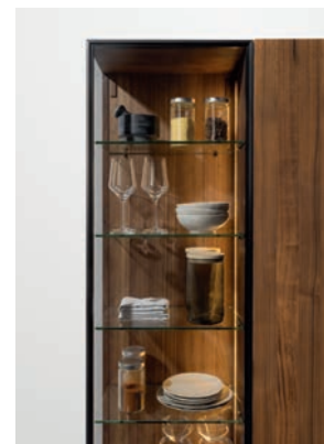
Glass cabinet and vertical grain pattern

Comfort and convenience are the meat and potatoes of every kitchen and are key to our well-being in everyday life. That's why TEAM 7 thinks about the wishes of users right from the (product) development stage, integrating an array of optional extras into its kitchen and furnishing concepts right from the word go. Just like the new magnetic solid wood panel, for example. Although at first glance it looks like any other high-quality wood board, the back of the panel has a series of holes that are filled with metal dust, transforming it into a nifty board that can hold messages, shopping lists, recipes and much more. The 2023 production run is also showcasing another special feature for the linee kitchen: the wooden fronts of the linee kitchen model are now also available with a vertical grain. TEAM 7 is thus opening up a whole new world of possibilities when it comes to kitchen design and is once again impressively underscoring its vast expertise in wood.