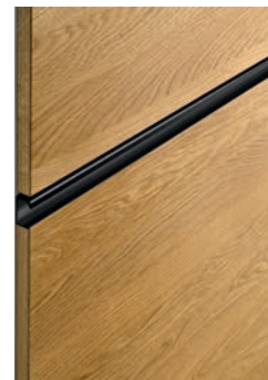
Flush-fitted strip handles in matt black