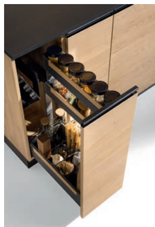
Well-organized: functional pull-out