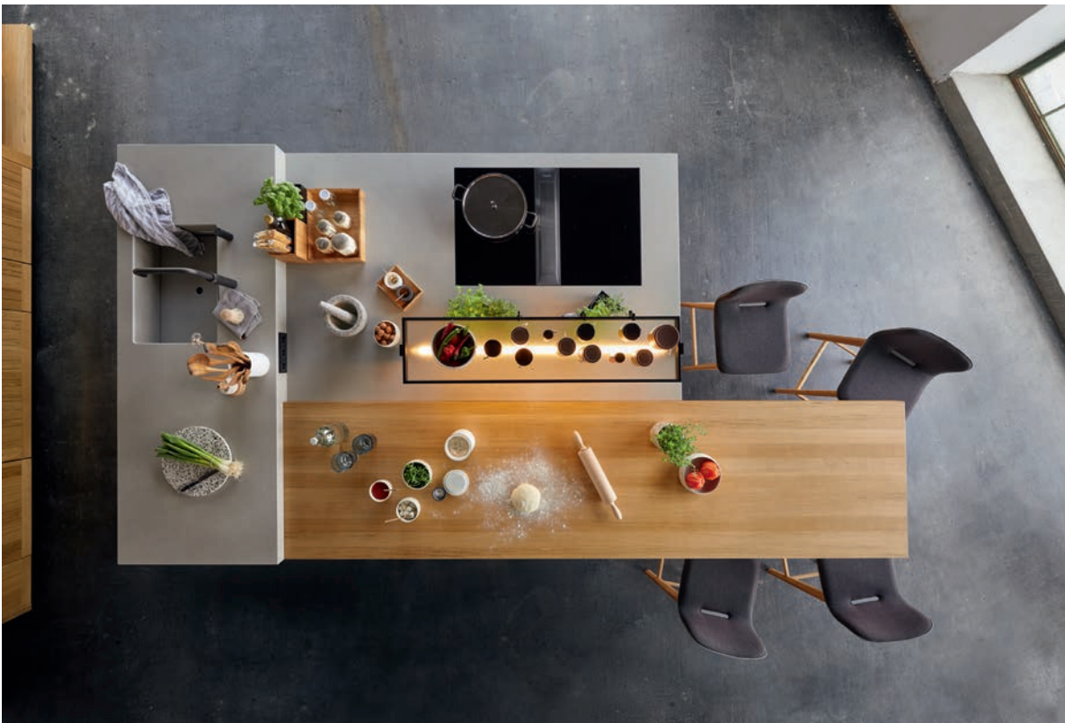
Only natural ingredients: echt.zeit kitchen

Every chef has different preferences – not only in terms of their food, but also of the kitchen itself. What they all have in common, however, is a passion for high-quality ingredients and enjoyment in playing around with their own inventive combinations and having maximum creative freedom. Whether specially handcrafted, sporting a modern country cottage style, open-plan or enclosed – TEAM 7's premium solid wood kitchens are geared exactly to the wishes of their users in terms of design, layout, storage space and functional features. The result is a custom-designed dream kitchen that will bring you joy for a lifetime to come.