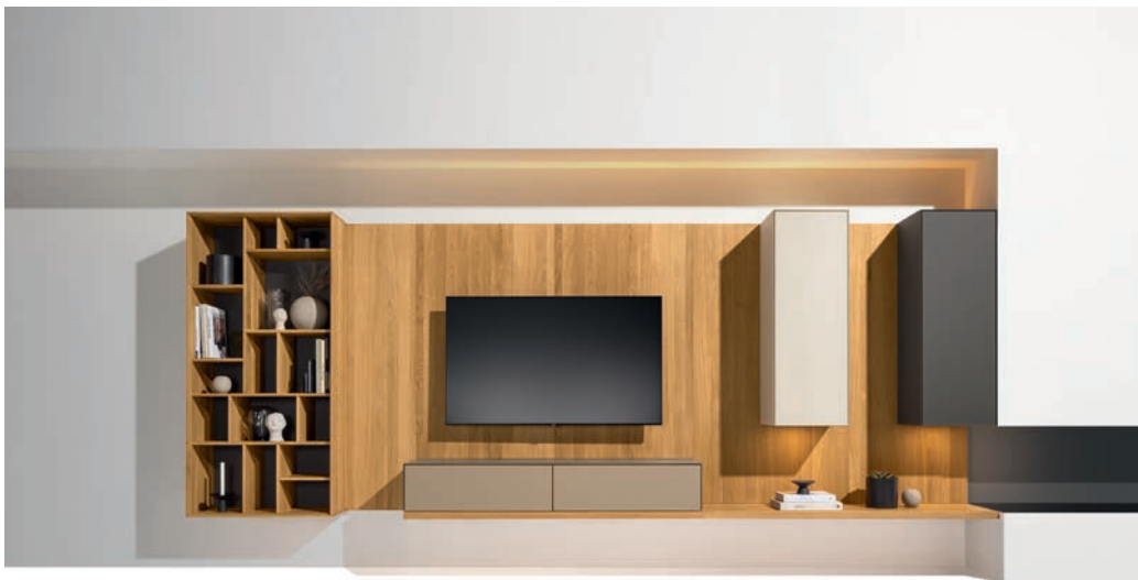
The modular wall units fit into the architecture of the room

At the heart of this concept is the specially developed wall panel, which meets the highest standards of stability, structural strength and individual planning freedom. The solid wood panels are now available with a vertical grain pattern in addition to the original horizontal grain. This not only expands the creative options in terms of how the panels look, but also means wall units can be planned to cover a broader area. The panels also offer great flexibility in length and can be customised to fit any ceiling height; they reveal the full appeal of their aesthetic over a large area and give the room a whole new look. Meticulously engineered and manufactured using high-quality three-layer technology, the panels are strong and warp-resistant, allowing TV equipment, wall shelves, cabinets and the separate 39 mm thick top board to be mounted securely. The result is almost unlimited design freedom using the cubus , cubus pure and filigno living room ranges.