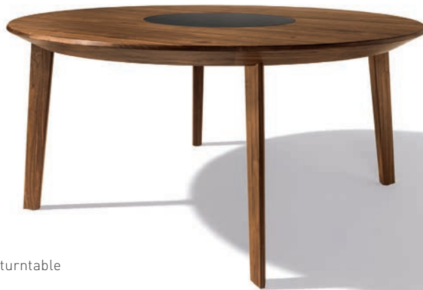
miró dining table with turntable

Its round table top makes miró the perfect focal point for get-togethers and open communication. Thanks to its space-saving form and choice of sizes it fits equally well in generously proportioned living spaces or more compact ones. The sophisticated craftsmanship of miró combines tremendous stability with slender elegance. The table top is made of high-quality, warp-resistant deciduous timber, with a bevelled upper edge, and the supporting frame is bevelled inwards, creating a refined, sophisticated profile. The design concept is also inspired by ergonomic principles. Its gently rounded upper edge allows you to rest your forearms comfortably on the table and enjoy the pleasing tactile feel of pure solid wood. The same thinking is evident in the design of the table legs. The interplay of angular and rounded lines echoes the form of the table top. They are positioned at the outer edge, ensuring maximum freedom of movement and optimal seating comfort. The table legs are slightly flared for maximum stability. A distinctive feature of the design is the way precisely handcrafted notches are used to fit the table legs neatly into the frame, so that these merge to become a single fully integrated element. Together the table top, frame and legs create a perfectly balanced and harmonious whole.