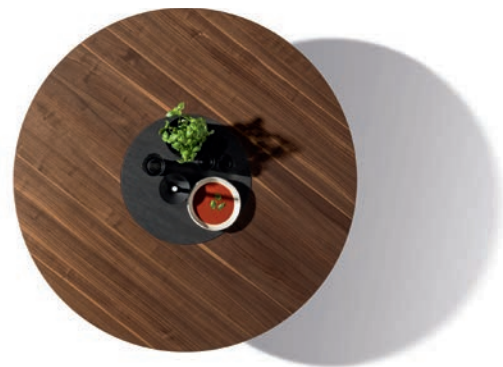
Table top with turntable finished in solid wood, coloured glass or ceramic