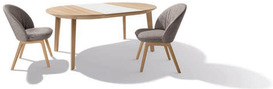
miró table and flor chair