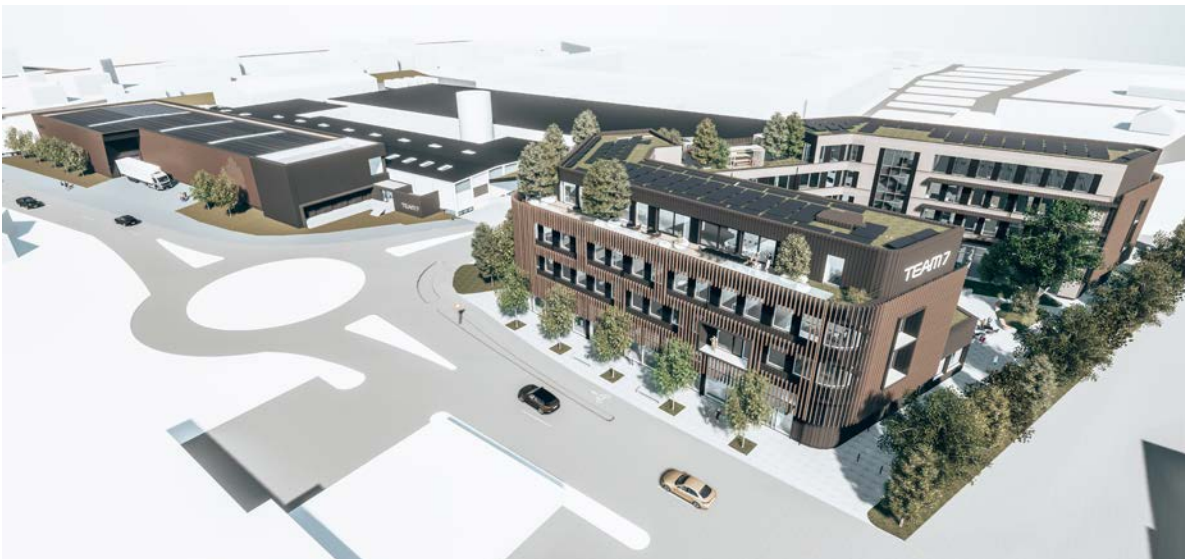
The vision becoming a reality: green plant and TEAM 7 Welt

With TEAM 7 Welt and the green plant, TEAM 7 is pursuing its vision with determination and will continue unstintingly on its green journey. After all, sustainable production is an ongoing process and has to be actively embraced day in, day out. As a pioneer of eco-furniture, the company has been committed to sustainability for over 40 years – for the sake of the environment and the people who live in it. Numerous international certifications in the fields of environmental and quality management are proof of this commitment. In recognition of its ecologically faultless, sustainable and fair production, for instance, TEAM 7 has been awarded the Austrian Ecolabel and the EMAS European environmental quality mark and has been certified to ISO 14001 and ISO 9001.