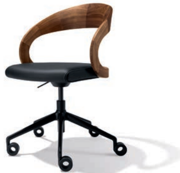
girado office swivel chair