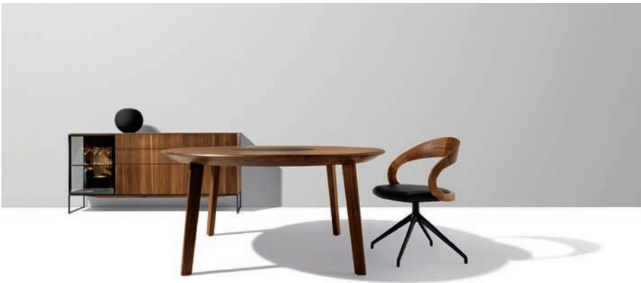
miró table, girado chair and filigno sideboard

products with an optimal functional and aesthetic lifespan. And that requires the best possible combination of quality, functionality and form. A key factor for me is the fascinating attributes of solid wood: its vibrant appearance, striking tactile feel and of course its extraordinary versatility. I try to incorporate these characteristics into new, exciting and attractive forms – while keeping to a minimalist and uncluttered design style. Ideally this means the furniture maintains its appeal beyond the changing trends and will delight whole new generations over the decades to come. But what is most important to me personally is that people just enjoy using the furniture for its intended purpose – in the case of miró for instance, shared meals and spending time together. So ultimately the focus is on the needs of the people who use it, and not some abstract design ideal. We want our furniture to enrich people's lives – in many different ways.