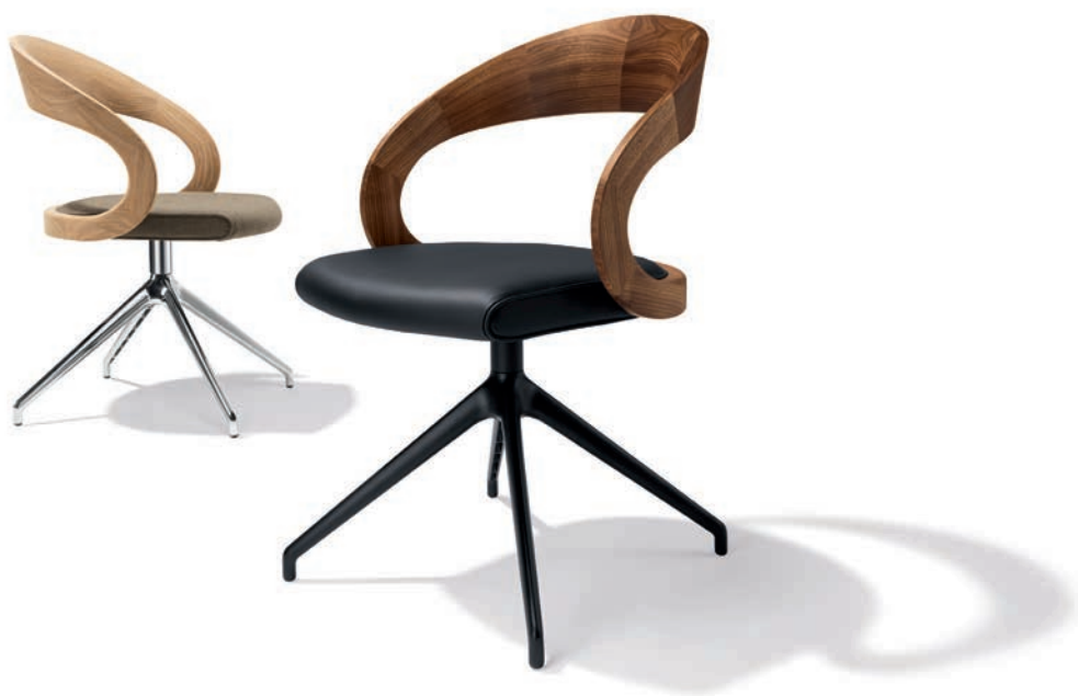
girado chair with swivel base in glossy chrome and matt black