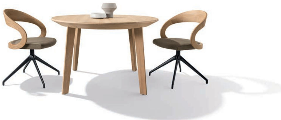
girado chair and miró table