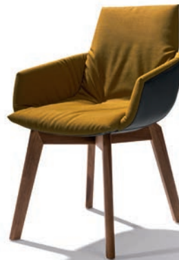
lui léger chair with wooden frame