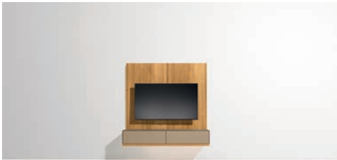
Central panel with cubus pure storage unit

ments and visual preferences. This means the panels can be configured to form the perfect stage. They bring the vibrant looks and sensual feel of wood into the home, emphasising the impact with a generous expanse. The result is a uniquely pleasing atmosphere, where cosiness, architecture and nature are melded together.