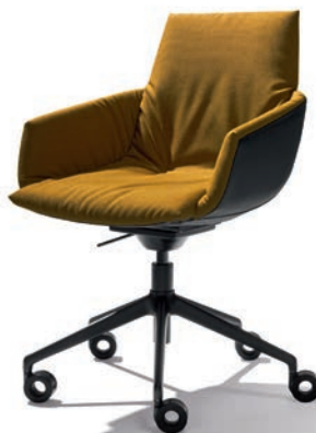
lui léger office swivel chair