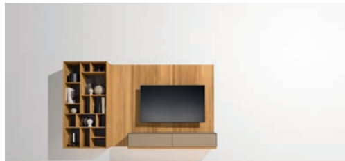
Central panel with cubus pure storage unit and graphic design element