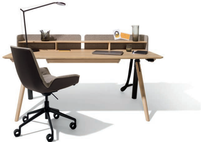
pisa desk and lui office swivel chair

Because TEAM 7 sets such high standards for its own aesthetic style and has a strong capacity for innovation, the company is able to constantly refresh its range of furniture with outstanding functionality and timelessly appealing shapes – in the constant awareness that good, sustainable design is only possible when it is in harmony with nature.