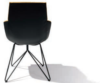
lui léger chair with filigree wire frame