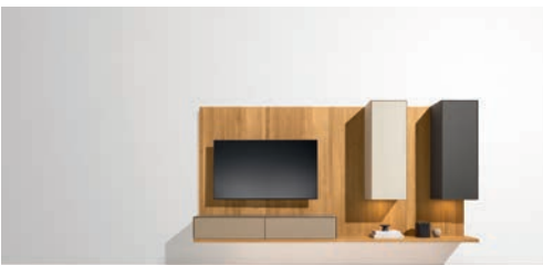
Central panel with cubus pure storage unit, top board and cubus pure cabinets