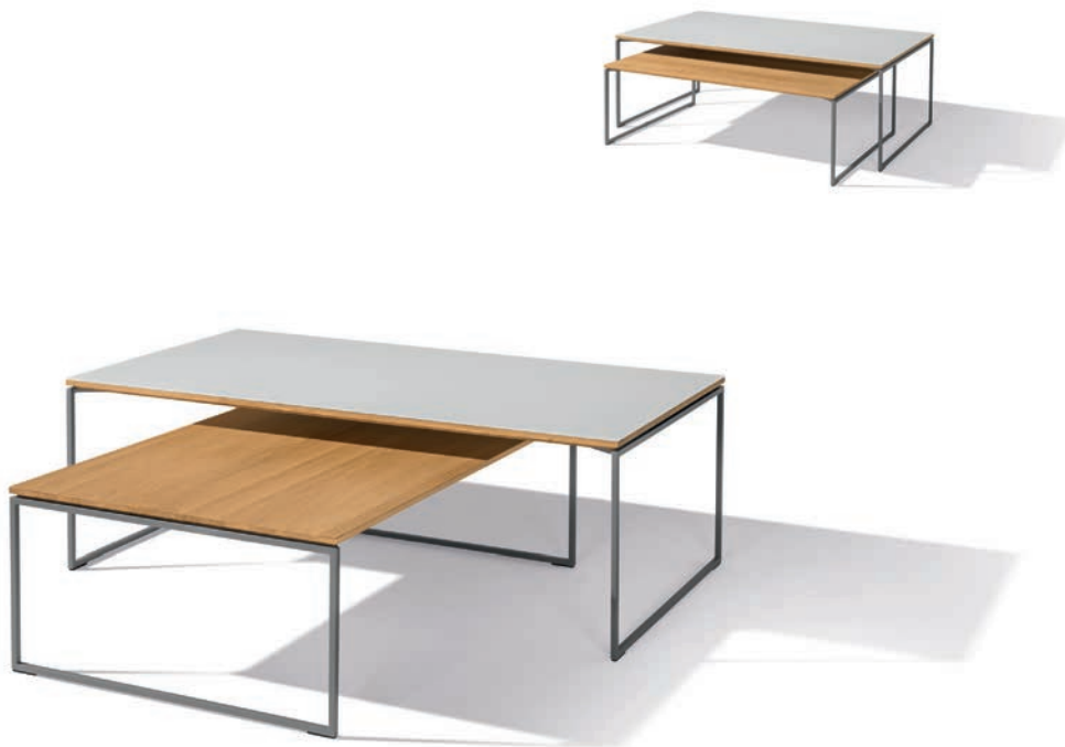
Single or together: filigno coffee table with two different heights

Dimensions: 34.5 or 42 cm height, 65, 80 or 90 cm width, 65, 80 or 90 cm length (+ 100 or 120 cm length with 65 cm width)