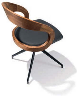
Unique dynamic design