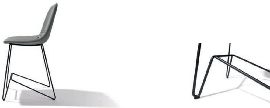
Artful contouring: the foot rest becomes part of the frame