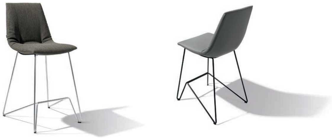
lui bar chair with many design options