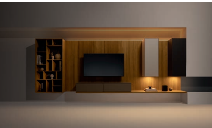
Individual design options with storage space and decorative elements as well as smart lighting solutions