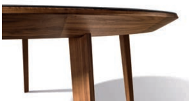
Characteristic detail: table top, frame and legs create a perfectly balanced and harmonious whole