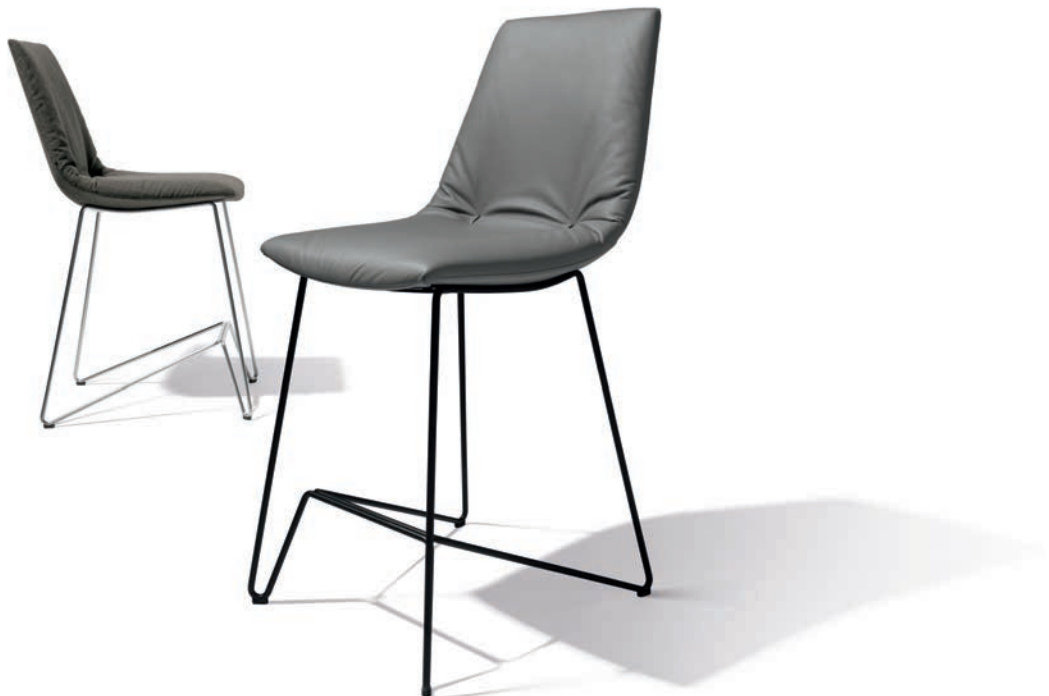
lui bar chair with elegant wire frame in glossy chrome and matt black

The shell of the lui bar chair has been designed to fit snugly around the shape of your body. The fully sculpted upholstery – consisting of two ergonomic foam moulds – ensures superior seating comfort, as does the high backrest. The elegant wire frame is visually inspired by the dining chair: it gives the bar chair its special lightness while also offering a dynamic touch. Another design trick: thanks to the artful contouring, the foot rest becomes part of the frame and its clever height offers additional comfort while sitting. The seat height is about 67 cm. The wire frame is available in matt black, glossy chrome or with a stainless steel finish. The lui bar chair can be designed in all TEAM 7 fabric and leather colours – making it extremely versatile. This is because different materials and colours can be selected for the inside and outside of the seat and backrest.