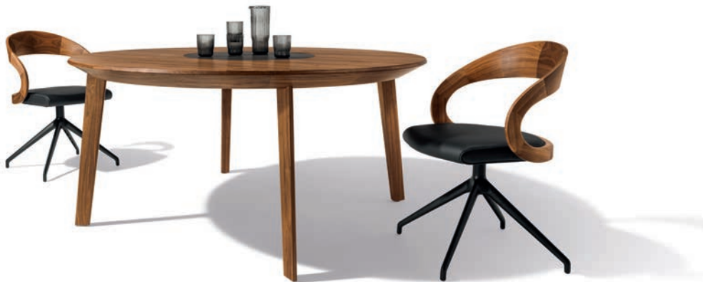
miró table and girado chair

Carefully manufactured from premium quality materials, miró is an homage to craftsmanship and nature: artisan skills, showcased with meticulous and loving care, are just as much a part of the aesthetic as the elegant, minimalist design style and the sensual beauty of solid wood. In keeping with TEAM 7's consistently ecological principles, the miró table meets sustainable standards throughout its entire life cycle. This is reflected not only in the timeless design style but also the use of solid wood, which is grown in sustainably managed forests and treated exclusively with natural oil. Manufactured using resource- and energy-efficient processes, this table will give pleasure for a lifetime: design, function and nature in perfect harmony.