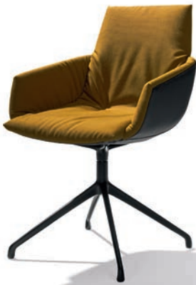
lui léger chair with swivel base