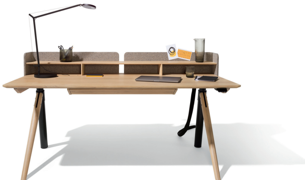
pisa desk with top unit and drawer