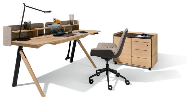
pisa desk, pisa desk pedestal and lui plus office swivel chair

It is this combination of craftsmanship and ultramodern technology that gives the furniture its soul. The interplay between lovingly hand-crafted details and precise high-tech manufacture opens up new dimensions in design and also balances the character of the striking solid wood with the high demands on intelligent functionality. This is because integrating the patented features perfectly into the design while also doing justice to the material calls for great skill in craftsmanship. From soft-close table extensions and floating doors through to height-adjustable kitchen islands, coffee tables and desks, a team of developers boasting a wealth of expertise with wood is always working on thinking up innovations and putting them into practice.