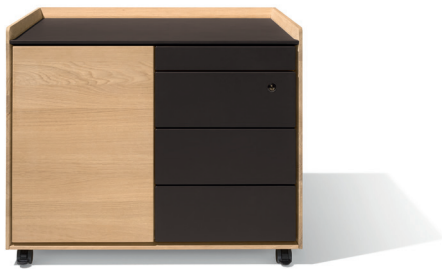
Leather cover on demand

“Professional storage space for the office or home office packed in a simple and elegant cover made of pure solid wood and leather.” Designer Kai Stania