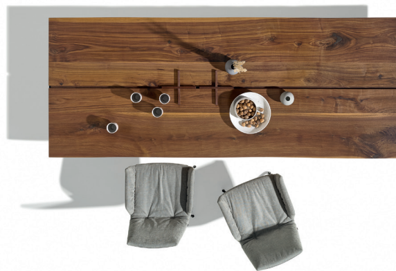
echt.zeit table and lui plus chairs

By keeping a handle on the entire supply chain, basing its manufacture locally and offering an unrivalled depth in its production system, the ecological furniture pioneer is one of the global market leaders in premium solid wood furniture. This success is the result of some key decisions such as focusing rigorously on sustainability, keeping production in Austria and making bespoke, high-quality furniture that lasts a long time.