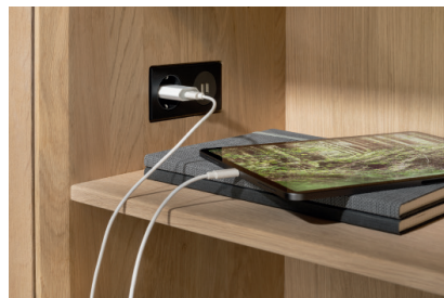
Details: cubus pure sideboard with pull-out drawer and power connection