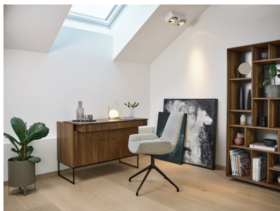
filigno bureau and lui plus chair with swivel base