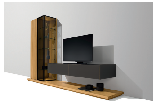
cubus pure wall unit with new glass colour graphite grey