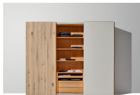
soft floating door wardrobe