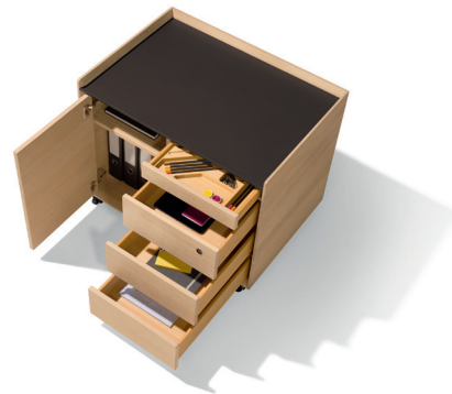
Office supplies practically stowed