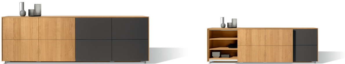
filigno sideboard 20 with flush-fitted sliding door

Thanks to the flush-fitted sliding doors with soft-touch opening, the filigno sideboard 20 can be individually planned for small rooms in an efficient way. In addition, the occasional furniture also makes visual statements: delicate joints break up the large surfaces of the fronts into filigree rectangles and give the furniture its elegant touch. In solid wood or combined with a coloured glass or ceramic front – depending on your wishes. The sideboard is available in three widths, two depths and in all TEAM 7 wood types.