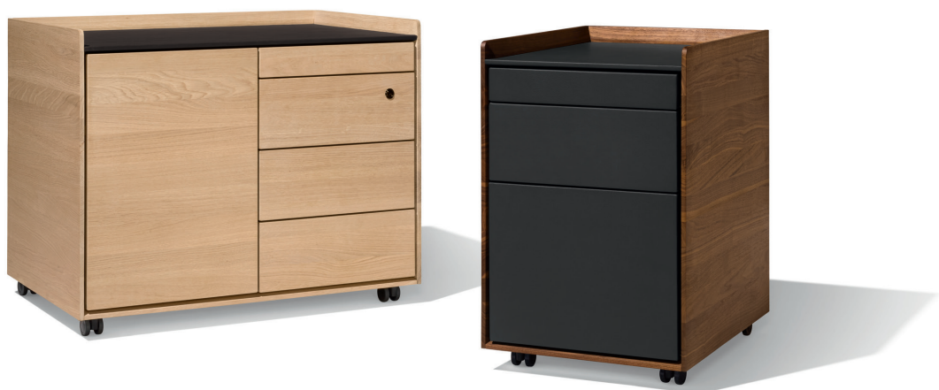
pisa desk pedestal in two sizes