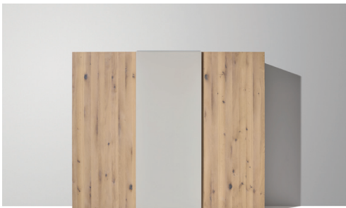
soft floating door wardrobe with new glass colour light grey