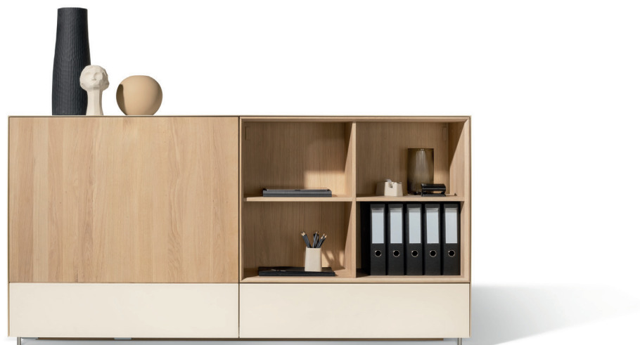
cubus pure sideboard: cuts a good figure everywhere