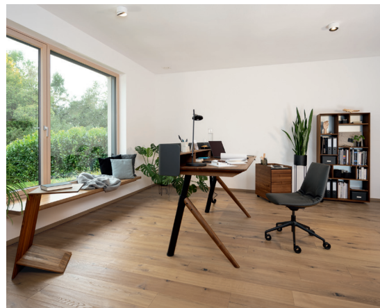
pisa desk and lui office chair

When carefully considered design and innovative technology meet cosiness and pure solid wood, the result is a modern living space: the wohnoffice T7 . This concept by TEAM 7 is redefining the connection between living, nature and working, going beyond the simple design of a home office area. wohnoffice T7 puts people and their health in the spotlight. The technical and ergonomic requirements are determined by the duration and type of work. The enormous range of products offered by TEAM 7 creates unique possibilities for holistic designs. Home working is increasingly taking over private spaces, calling for intelligent design solutions. TEAM 7 is rising to this challenge, with adept interior concepts for professional home working. Concepts that captivate with their cosy feel, sophisticated functions and superior craftsmanship, and adapt flexibly to individual needs.