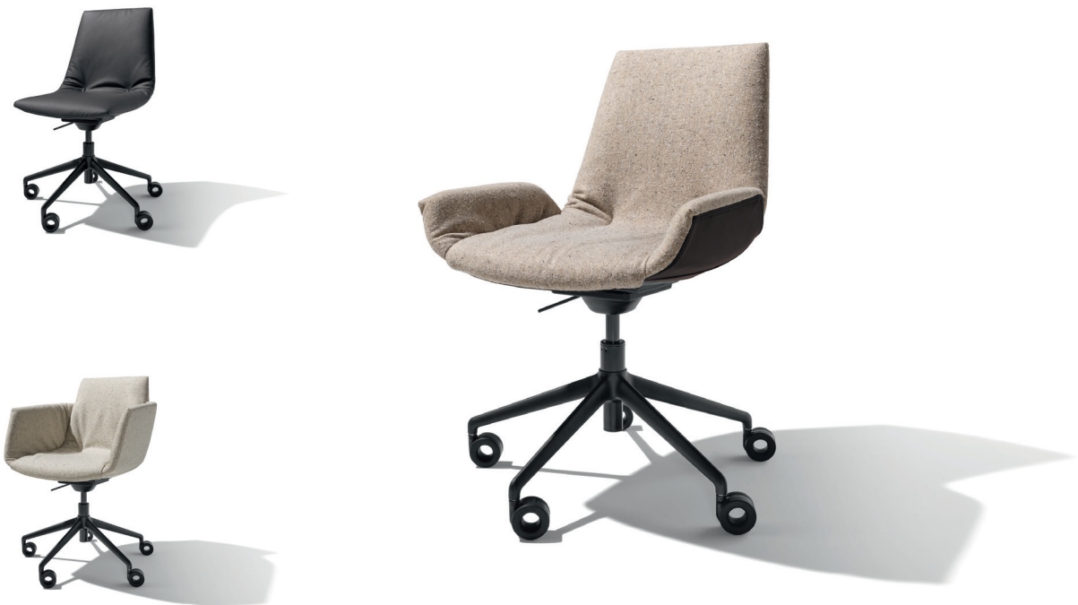
lui , lui plus and grand lui office swivel chair