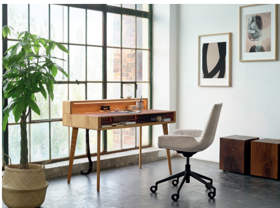
sol writing desk and lui plus office chair

With its wohnofficeT7 , TEAM 7 has created everything that’s needed to set up functional and yet attractively designed home office areas. From their size and materials to their inner workings, the pieces of furniture and system solutions are custom-made to individual wishes. All of the concepts are designed in great detail, sustainably manufactured and lovingly crafted from the finest natural materials. The different types of fine wood, finished exclusively with natural oil, promote a pleasant atmosphere and create a positive environment for people, helping them to keep a clear head. wohnofficeT7 encourages efficient working not only through the sophisticated design of the furniture, but also through the beneficial effects of solid wood.