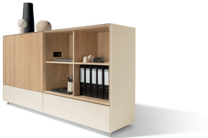
cubus pure sideboard with new glass colour natural white

TEAM 7 has expanded its multifaceted repertoire with the nuanced additions of a new leather colour and three new glass colours. By combining the various wood types in different ways neutral, understated and yet delightfully appealing colour combinations can be created – allowing new scope for your personal style preferences. This means that any of your favourite colourful vases can blend in well with the colour scheme. The new glass colours light grey and graphite grey exude a cool elegance and, like the soft natural white, combine elegantly with the attractive warmth of the wood. Light grey is the new addition to the range of leather colours L1 and enhances the elegant character of our furniture designs.