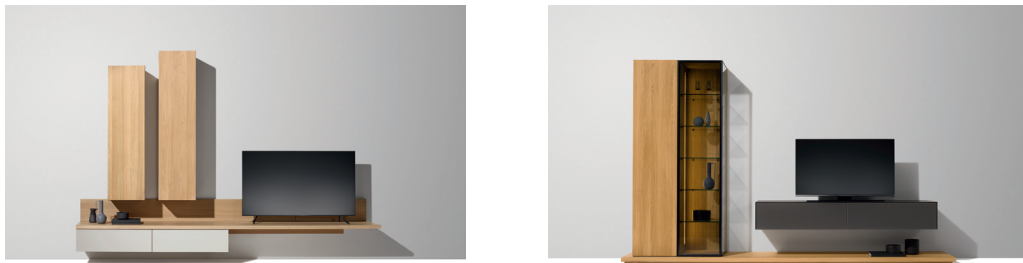
New design options for cubus and cubus pure wall units

Pure nature: the cubus living range inspires with handcrafted details and a high level of wood expertise, and all this is impressively accentuated by the characteristic 25 mm thick solid wood top. For wood lovers who want even more physicality, TEAM 7 has now developed another top board version. With its remarkable thickness of 39 mm, it brings the original strength and beauty of solid wood even more into focus – in terms of how it feels and how it looks. This gives the cubus wall units a delightfully new and purely modern look that exudes a passion for solid wood and a dynamic appeal. Manufactured in ultramodern three-layer technology, this innovative construction also impresses with tremendous structural stability and high load-bearing capacity.