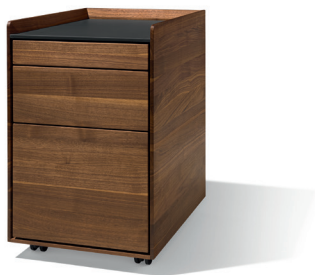
Flexible use due to castors