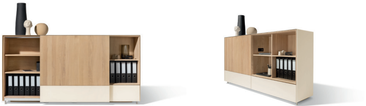
cubus pure sideboard with flush-fitted sliding door and elements of coloured