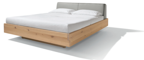
nox* bed with new leather colour light