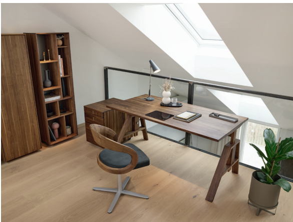
atelier desk and girado swivel chair