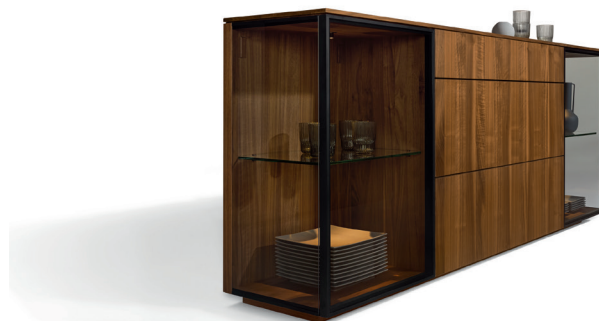
filigno sideboard 21 with aluminium frame

The filigno sideboard 21 with aluminium frame front looks equally impressive. The corner glass elements in clear glass or smoked glass are illuminated with movable black spotlights and thus subtly set the stage for your accessories. When mixed with closed drawer fronts, this creates a very unique piece of furniture for all occasions. There is also room for an optional drawer insert. The new filigno sideboard can be planned in two widths, two depths and in all TEAM 7 wood types.