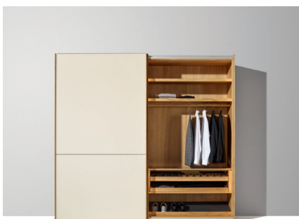
lunetto floating door wardrobe