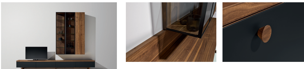
The thick top board, the aluminium frame doors and the knob handle dot create individual cubus wall units.

With the new matt black aluminium frame doors in clear glass or smoked glass, TEAM 7 opens up further elegant possibilities for the individual design of wall units, highboards and sideboards. Both sides can be glass around the framed corner, opening up interesting sightlines into and through the units and coordinating perfectly with all TEAM 7 wood types. Countersunk into the wooden element and concealed by the aluminium frame, the door hinges move discreetly into the background. This allows the aluminium frame doors – supported by dimmable LED light strips or dazzling spotlights – to reveal their full brightness.